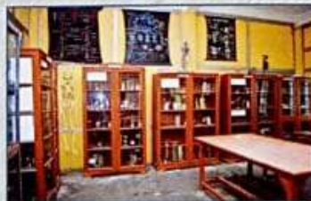
The Zoology museum