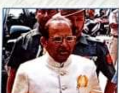
Prof. Jagdish Mukhi Hon'ble Governor of Assam