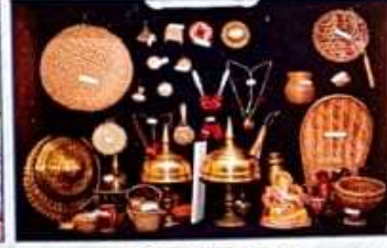
Museum of the Assamese Department