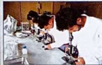
The Botany lab