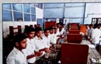
The Chemistry lab