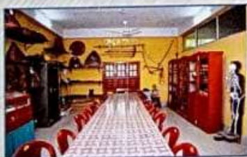
The Anthropology lab.