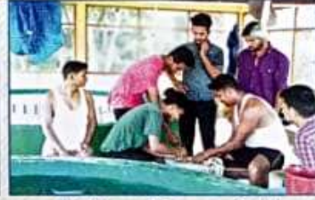
Fish breeding practical under Community College