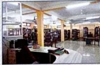
The Kameswar Das Library