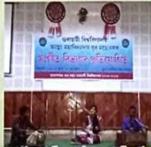
Participant of our College at the Inter College Youth Festival