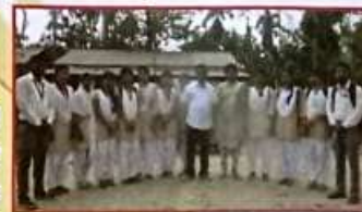
Anthropological field work at KHARETARI LUWASUR VILLAGE UNDER GOBARDHANA BLOCK OF BAKSA DISTRICT (BTAD), ASSAM (2016-17)

The 6 th Semester (General) students of Anthropology Department conducted a field study in Sundaridia village of Barpeta District & 6 th Semester (Major) students of Anthropology Department conducted a field study in Kharetari Luwasur village of Baksa District.