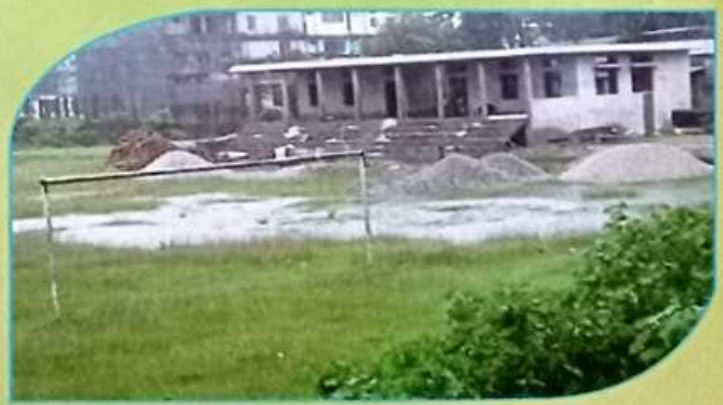
State of the Art Sports Infrastructure is under Construction