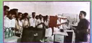
Educational Trip to Tezpur University