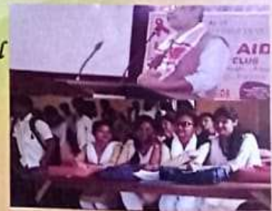
International AIDS Day Celebration