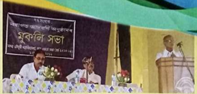
Moments of celebration of 77th Freshmen Social.