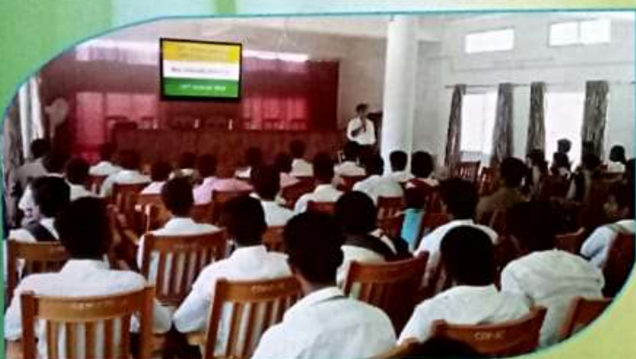
70 th Independence Day was Celebrated in the College Premises.