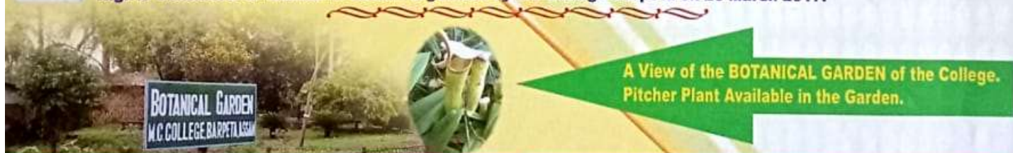
A View of the BOTANICAL GARDEN of the College. Pitcher Plant Available in the Garden.