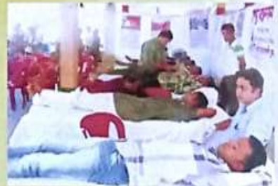
Blood Donation Camp Organised by Red Ribbon Club