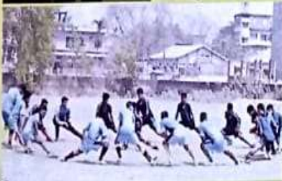
Training Session of Football Club