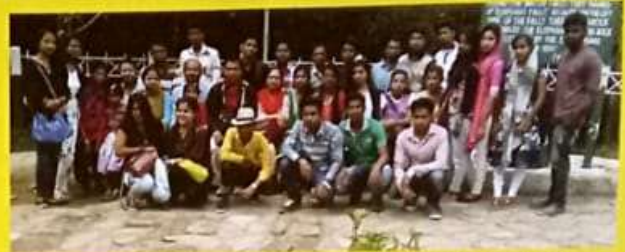
An Educational tour of Students of Botany to Shillong