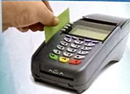
Our College Encourages Cash-Less Transection & all Financial Transections are under Digital Process now.