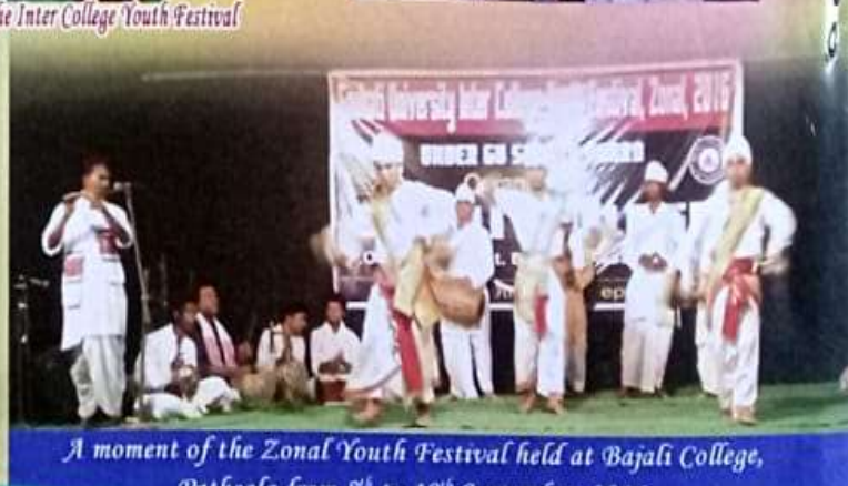
A moment of the Zonal Youth Festival held at Bajali College, Pathalsala from 8 th to 10 th September, 2016