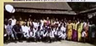
Students of Assamese Dept. during Field Trip