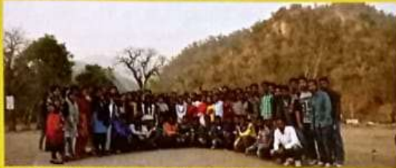
An Educational tour of Students of Botany to Bhutan Chowki

The Department conducted two educational excursions- one to Shillong, Meghalaya and another to Bhutan Chowki, Baksa for the Degree Major Students of the Department.