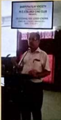
Moments of 'An Evening for Good Cinema' by Barpeta Film Society in association with M.C. College, Barpeta on 27. 05. 2017.