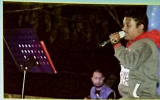
Geet at District Library hall, Guwahati & bagged 1st Prize in Senior Section. He also bagged the 2nd Prize in Senior section of Bhupendra Sangeet Competition held at Belsor & Solmara.