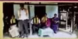
Teachers of Assamese Dept. in Field Trip

A group of students of 4th Semester (Assamese Major) visited Sidli of Chirang District of Assam for field study on cultural aspects of Ethnic group of Koch Rajbongshi.