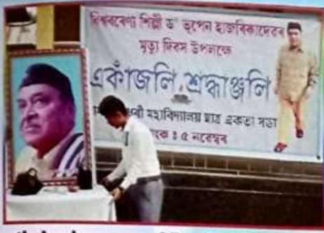
Death Anniversary of Dr. Bhupen Hazarika was observed in the College by the Students' Union on 5th November, 2016.