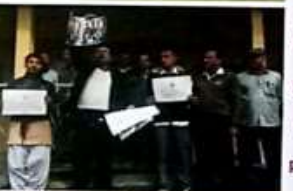
Felicitation to NSS volunteers who participated in the National Republic Day Ceremonial Parade at New Delhi.

Principal and Teachers' meet on 10 June, 2016.