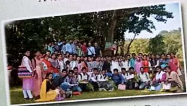
Students participated in Botany excursion