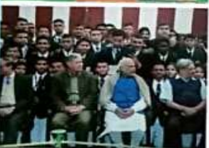
NSS volunteers of M.C. College with Prime Minister of India.