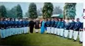
NSS volunteers of M.C. College with Vice-president of India.