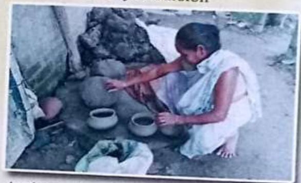
Anthropology department visited the pottery industry in rural area