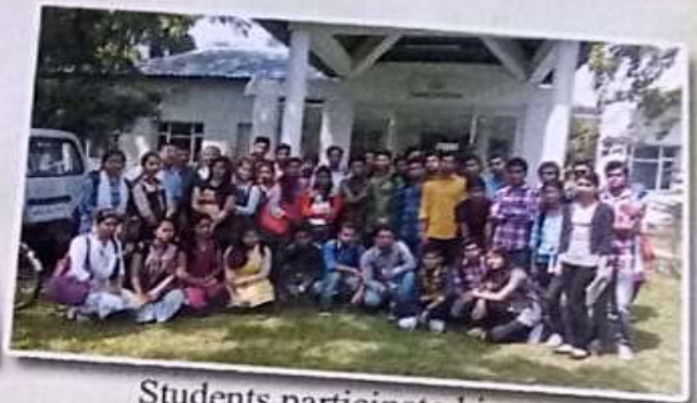
Students participated in Botany excursion