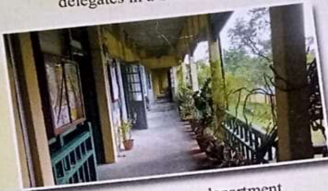
A view of Botany department