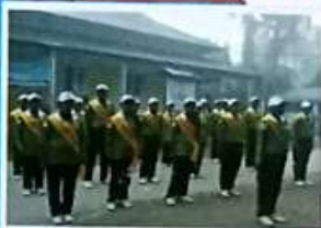
M.C. College NSS Parade Team.