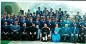
NSS volunteers of M.C. College with President of India.